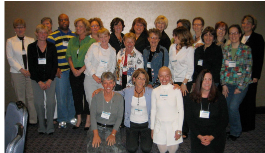
Lung Cancer Survivors at the 2008 Advocacy Summit