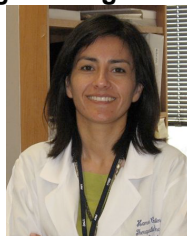
Ilse Valencia Hamon Center for Therapeutic Oncology Research, University of Texas Southwestern Medical Center