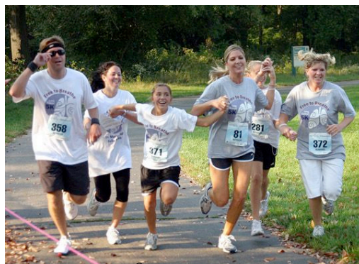
Free to Breathe® events are family-oriented