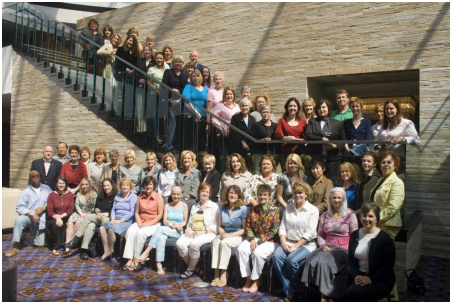
2008 Advocacy Summit Participants

The first ever Lung Cancer Advocacy Summit, Acquiring Tools, Effecting Change , was held May 27-29, 2008 in Chicago, IL. The Summit provided training and guidance to 50 grass-roots lung cancer advocates. The topics discussed were: understanding lung cancer, how to be your own health advocate, becoming a lung cancer consumer reviewer, how to de-stigmatize the disease, raising lung cancer awareness in your community, and how to navigate the legislative process. No lung cancer organization had ever brought advocates together in this manner before.