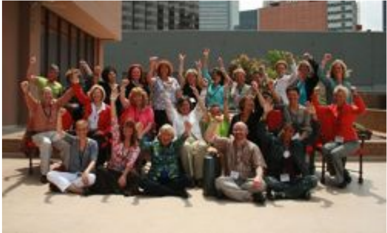
Lung Cancer Survivors at the 2009 Lung Cancer Advocacy Summit

The topics discussed were: understanding the science of lung cancer; becoming a lung cancer consumer reviewer; engaging the media; crafting your message; influencing the legislative process; and raising lung cancer awareness in your community.