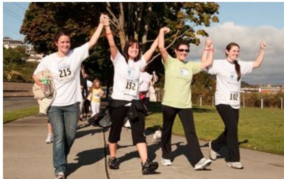
Participants unite to fight lung cancer at the 2009 Free to Breathe® 5K Run/Walk in Tacoma, WA

NC - Durham Yogathon – December 21 NC - Raleigh – November 7 NC - Triad – November 14 NE - Lincoln – October 3 OH - Dayton – November 7 OH - Toledo – August 29 PA - Philadelphia – November 1 RI - Providence – October 17 SC - Columbia – November 21 WA - Seattle – November 8 WA - Tacoma – September 19 WI - Madison - September 27